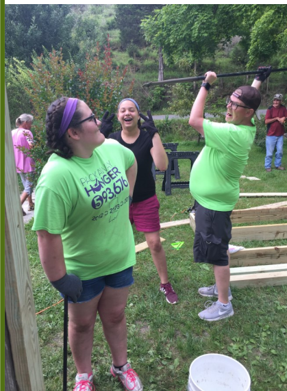
Youth Work Camp